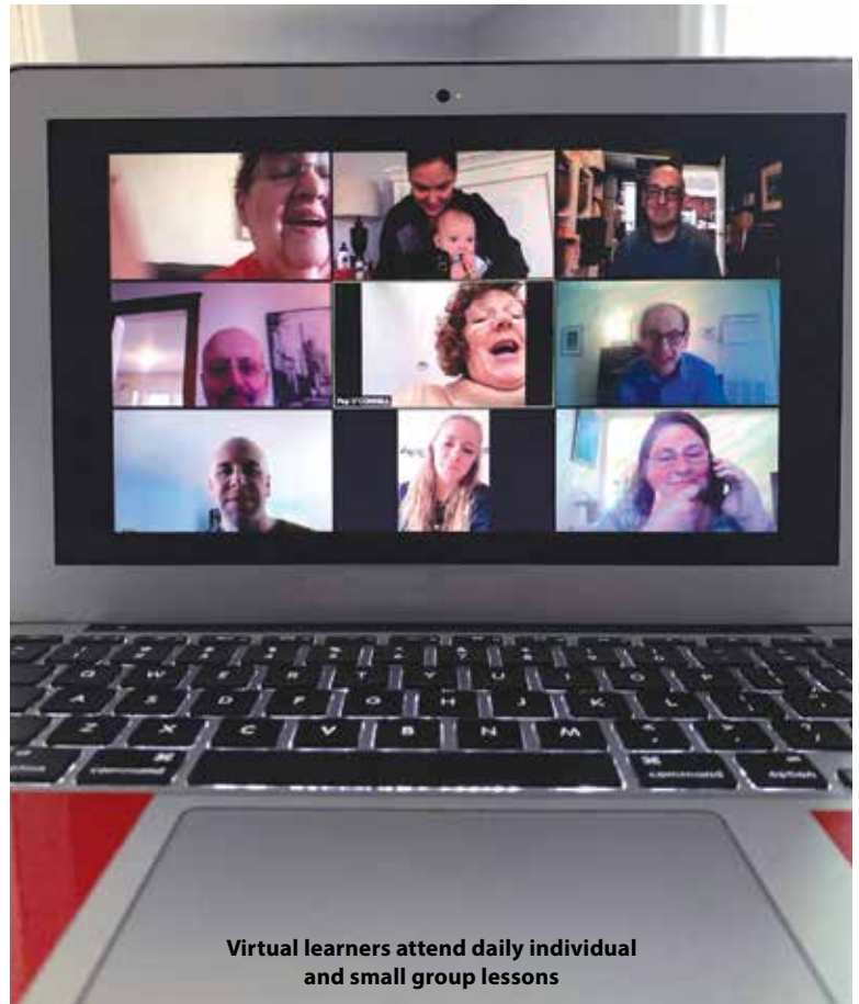
Virtual learners attend daily individual and small group lessons

Vista Life Innovations is a 501©3 nonprofit organization with campuses in Madison and Westbrook. Vista's mission is to provide services and resources to assist individuals with disabilities achieve personal success. For more information about Vista, please visit www.vistalifeinnovations.org .